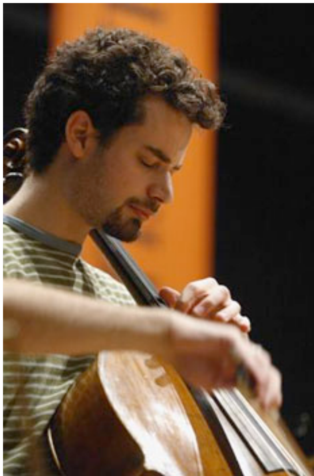
Cellist Mickey Katz